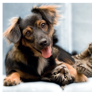
Safe for all your Family