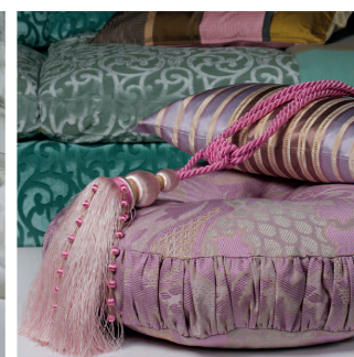
Perfect for Fine Silks

For More Information visit www.rugrenovating.com/microseal or call Laura at 1-800-252-7738 Ext. 207